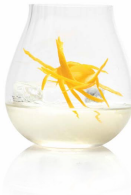
LEGEND OF WAKOU 85