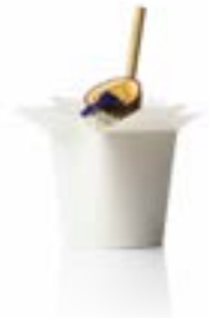
HAPPY END 85