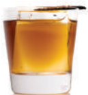
FOREST REBEL 23