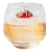
WHITE JEWEL 19

Please note all prices include VAT at the current rate. A discretionary service charge of 15% will be added to your final bill.