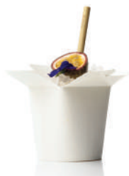
HAPPY END 16